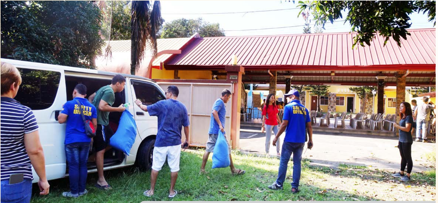
A MOVABLE TC — Residents disembark from one of several vans used to bring them simultaneously to the Blusyl Resort on January 28.