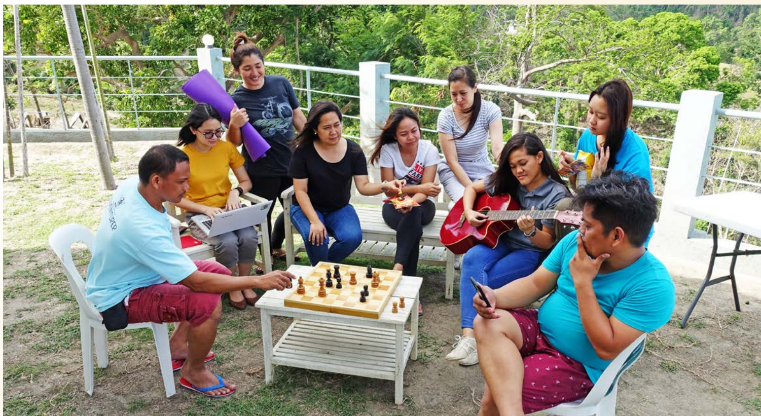
WELCOME RESPITE — Staff on day off enjoy the relaxing ambiance of the IITC Dining Pavilion terrace playing board games, jamming on the guitar, and even catching up with online studies.

The progress of the struggle to contain the pandemic continues to rage. It may be a while before we regain a semblance of normalcy. With God's grace, however, and the amazing resilience and fortitude of the staff, I am confident the SELF therapeutic community will surpass this unprecedented trial.