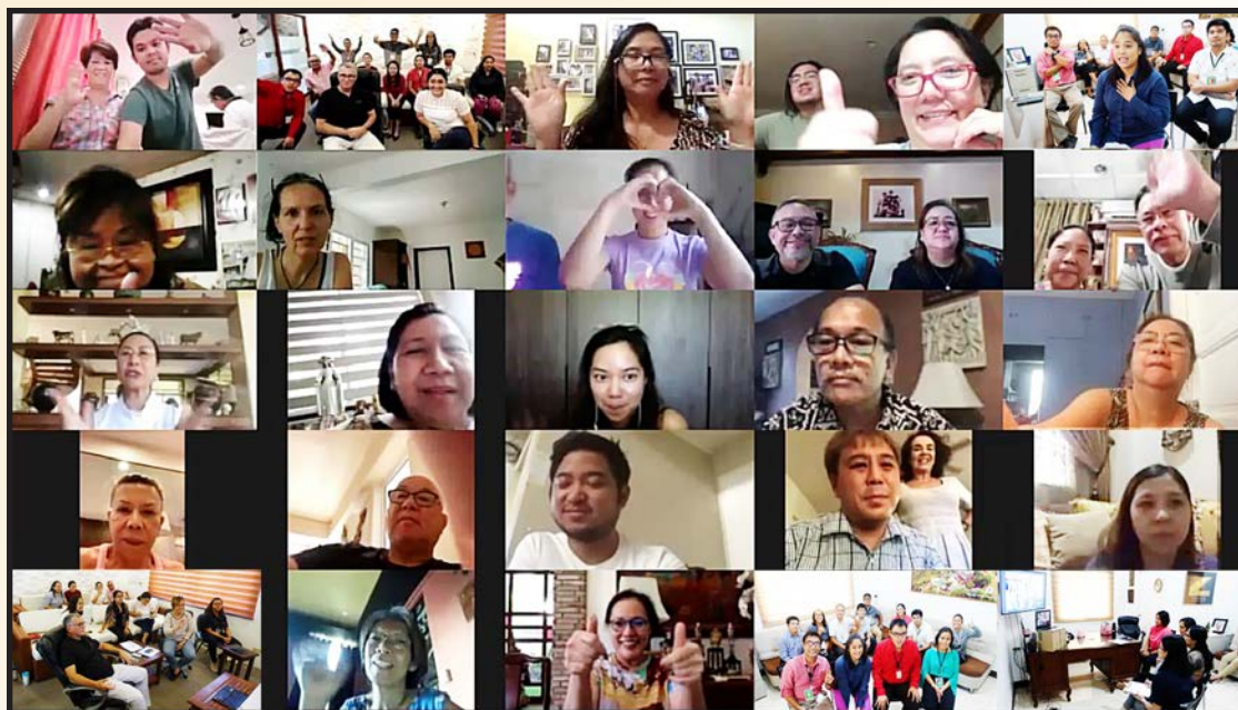
RESOUNDING SUCCESS — For the first time ever, SELF's monthly Family Association Meeting (FAM) was held online via the Zoom app on June 6. Photo shows a few of the more than 50 families who joined from their homes in the Philippines as well as from abroad.