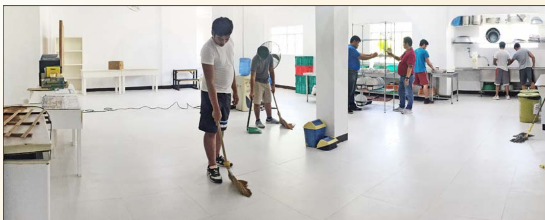
FACILITY UPGRADE — While the TC was taking refuge in the Blusyl Resort, SELF forged ahead with the project to refurbish the entire basement of the Multi-Purpose Hall that had been put on hold by the evacuation. With no residents around it was the opportune time to tear down nonessential rooms and retile the entire floor. Funds for this project had been earmarked from the proceeds of the 2019 Yuletide Show that raises funds to improve the facilities. In the photo, residents begin setting up the kitchen and the pantry in the handsomely renovated basement. More facility improvements are in scheduled in the coming weeks.