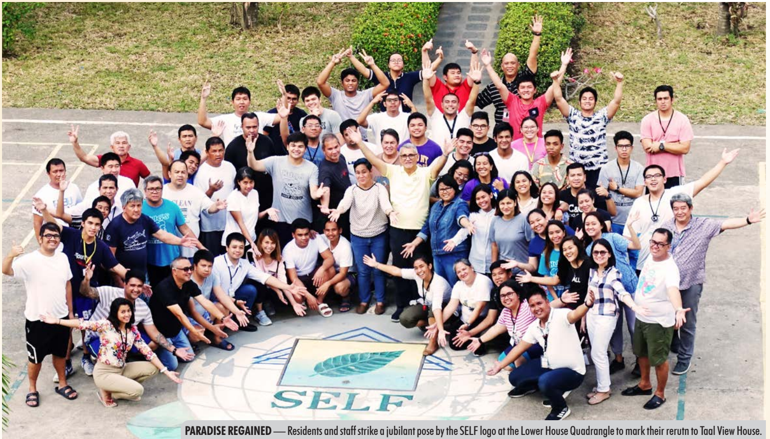
PARADISE REGAINED — Residents and staff strike a jubilant pose by the SELF logo at the Lower House Quadrangle to mark their rerutn to Taal View House.